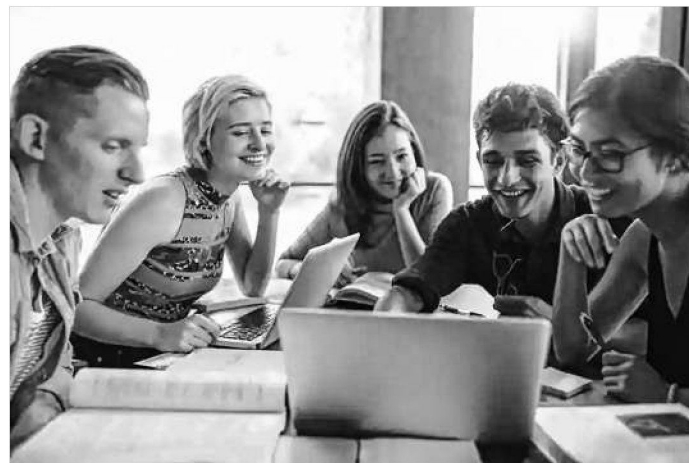
was created / open at their end, aka third parties. This link became public for a very short while when the system was being migrated to a newer and safer system. The migration has been completed since then and our students' data is safe," a spokesperson from Leverage Edu told the FPJ.

"The link in question was being used by our bank partners to access documents of students who had requested an education loan and given permission for their documents to be shared and